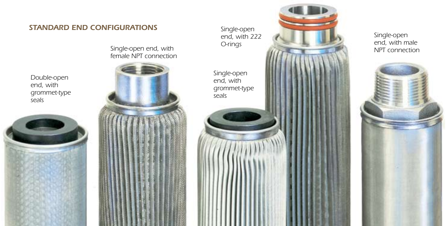
Double-open end, with grommet-type seals